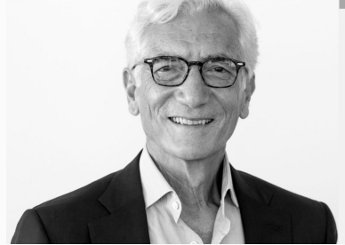
Sir Ronald Cohen

'We must all demand that companies account for their impact on the world around them – the same way they report profit and loss.' Sir Ronald Cohen, Impact investing pioneer.