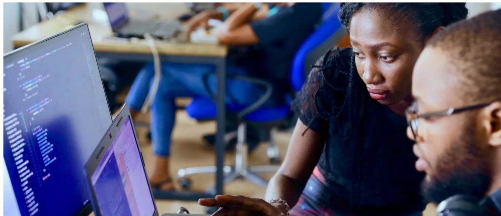
As populations grow, hundreds of millions of jobs will need to be created in sub-Saharan Africa alone.

NABII Zambia and the World Economic Forum’s for COVID Alliance for Social Entrepreneurs launched the Small and Growing Business (SGB) Financing Pathways Initiative . The ultimate goal of the initiative is to find effective ways to unlock an increased flow of financing for SGBs by supporting on-the-ground ecosystem leaders in Zambia in advancing the design and implementation of potential pathways, and enhancing connections, sharing of best practices and collaboration between the local finance providers who are closest to the SGBs on the ground, and public and private, national, and multilateral capital providers. Read more here .